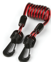
H01062 Coil Wrist Tether Single-Action Length: 17–77cm/7–30" Max Load: 1.0kg/2.2lbs