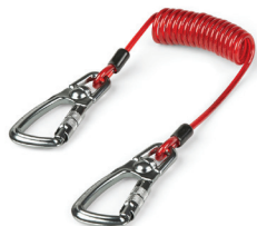
H01069 Coil Tether Dual-Action Length: 50–170cm/20–67" Max Load: 2.3kg/5.0lbs