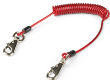
H01068 Coil Tether Single-Action Length: 40–160cm/16–63" Max Load: 1.0kg/2.2lbs