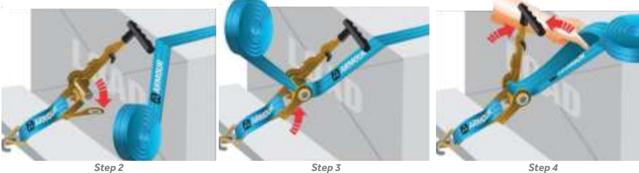
Step 2 Open Side Gate