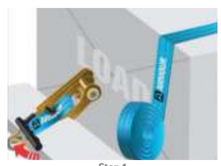
Step 1 Fix Straps and Hooks